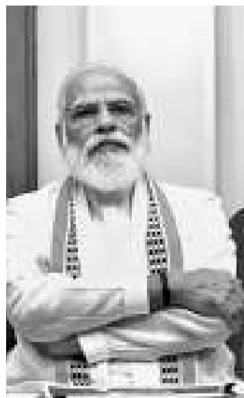
SAI ISHWAR Mumbai, 3 September

The hackers distanced themselves from Paytm Mall 'hack'