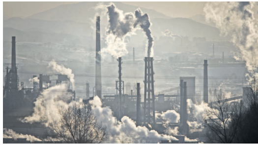
CII has written to the government saying the non-renewal of NOCs is leading to the closure of factories. [Illustration]

The policy vacuum triggered by a National Green Tribunal (NGT) order on the use of groundwater has impacted businesses across sectors. In view of the regulatory uncertainty, industry bodies have now approached the Jal Shakti ministry seeking relief on the use of groundwater, considering that more than 20,000 applications for no-object certificates (NOCs) have been put on hold by the authorities. Representatives of the Confederation of Indian Industry (CII) and the Federation of Indian Chambers of Commerce and Industry (Ficci) wrote to Jal Shakti minister Gajendra Singh Shekhawat and NITI Aayog vice-chairman Rajiv Kumar on June 16 to resolve the regulatory uncertainty over granting NOCs. The Central Ground Water Authority (CGWA), which issues the NOCs, has put the process on hold for critical and overexploited blocks since early 2019, following the NGT order involving a hospitality firm. The tribunal further ordered in January 2020 that permission should be granted on the basis of a study of groundwater availability and periodic report that replenishment had resulted in improvement. Non-renewal of the NOCs has become a thorny issue for the industry as a large number of businesses may find themselves on the wrong side of the law despite com-