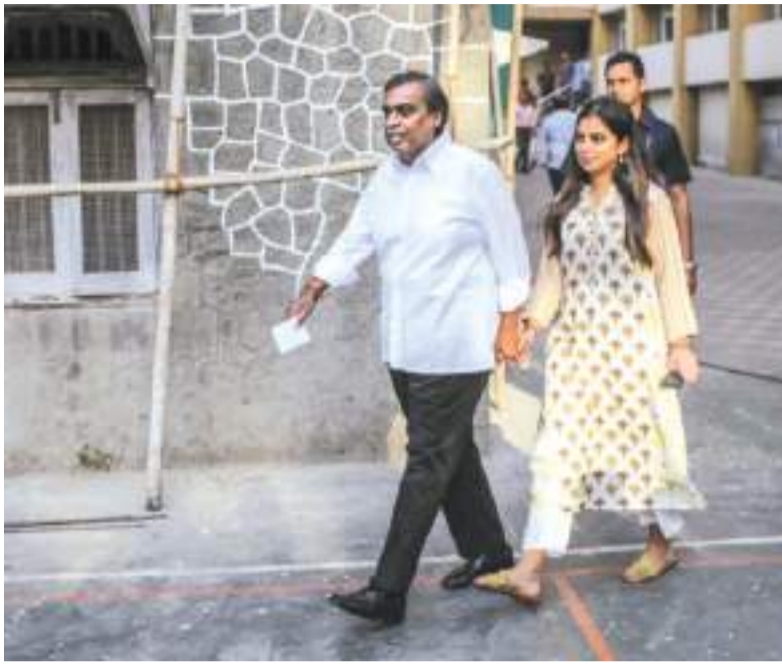
Isha Ambani made news last year when Reliance Retail revealed the JioBook, a 4G-enabled laptop, priced at ₹16,499. Her father, Mukesh Ambani, made mobile data a mass item and smartphones ubiquitous

"We must rise to the occasion, we must exert ourselves, and we must excel. Otherwise, we run the risk of becoming irrelevant," Ambani said. She also said: "So, by denying leadership roles to women, we