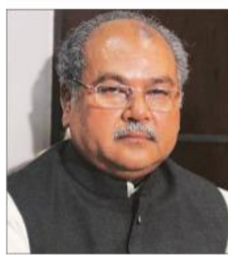
Agriculture minister Narendra Singh Tomar

"Today with an annual production of 308 million tonnes of food grains, India is not only in the realm of food security but is also catering to needs of