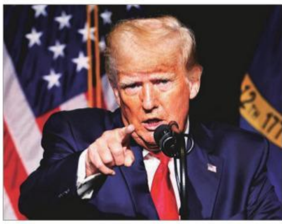
Former US president Donald Trump

The number of H-1B visas issued each year is capped at 65,000, plus an additional 20,000 reserved for individu-