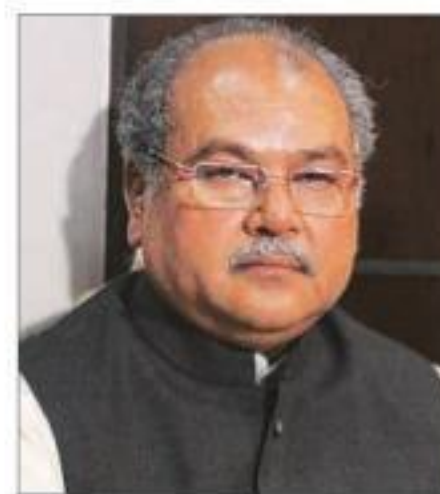
Agriculture minister Narendra Singh Tomar

"Today with an annual production of 308 million tonnes of food grains, India is not only in the realm of food security but is also catering to needs of