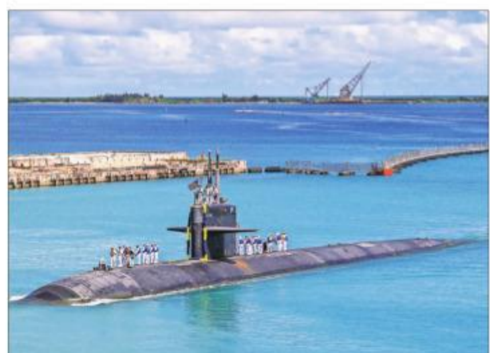
and Canberra was supposed to be based "on trust, mutual understanding and sincerity".

French envoy Jean-Pierre Thebaud delivered his comments Saturday as he left his residence in the capital of Canberra. "This has been a huge mistake, a very, very bad handling of the partnership," Thebaud said, explaining that the arms agreement between Paris