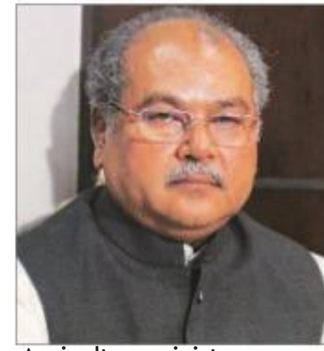
Agriculture minister Narendra Singh Tomar

"Today with an annual production of 308 million tonnes of food grains, India is not only in the realm of food security but is also catering to needs of