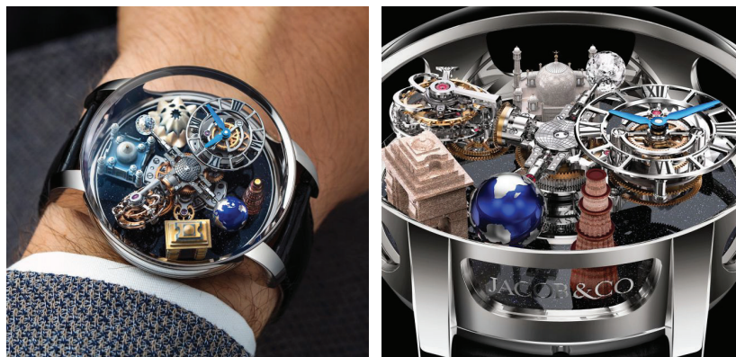
Astronomia Art India White Gold

It has a sizable portfolio of luxury and premium watches in India and retails over 50 luxury and premium watch brands, of which over 30 brands are available exclusively at Ethos in India.