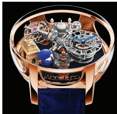
Astronomia Art India