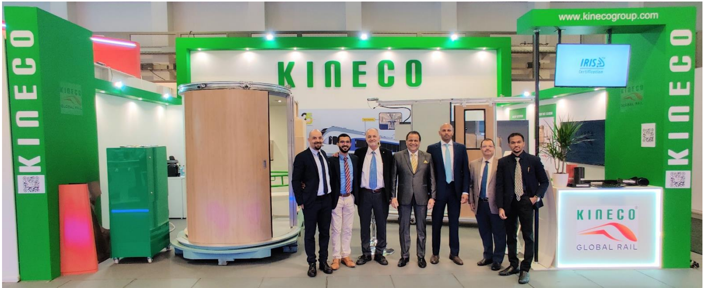
Team Kinenco at InnoTrans 2022 Rail Exposition with the newly launched Global Rail Portfolio

Pilerne- Goa based, Kinenco Limited, a Company engaged in design and manufacture of composite products & sub-systems across diverse segments announced the launch of its proprietary New Gen Rail Product Portfolio for High Speed Trains under its newly conceived international brand “Kinenco Global Rail” at the InnoTrans 2022 Expo, Berlin held from 20 Sept, 2022 –23 Sept, 2022.