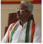
Renowned actor, Atul Kulkarni essays the role of the strong and powerful Aameya Rao Gaikwad in the series. Audiences have enjoyed watching him across seasons and season 3 will bring a new edge to his character. The versatile actor delves into the intricacies of Aameya, reflecting on the profound impact the script and writing have on his role. Kulkarni acknowledges the multitude of paths the character could have taken, yet asserts that the chosen direction is both justified and natural. (19-8)

AHMEDABAD, Hunger for power, betrayal, and ascension to one throne - the most influential and powerful Gaikwad's are back with the third season of Hotstar Specials' City of Dreams. Produced by Applause Entertainment in association with Kukuronor Movies and directed by Nagesh Kukuronor. Starring the versatile actor Atul Kulkarni, Priya Bapat, Sachin Pilgaonkar, Sushant Singh, Ejaz Khan, Ranvijay Singh, and many others in pivotal roles, the series will stream 26th May onwards, only on Disney+ Hotstar.