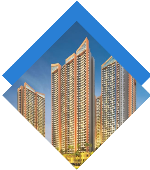
ARIHANT ASPIRE (Panvel)