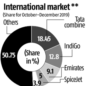
** Older share taken to reflect pre-Covid times. Tata combine: Air India, Air India Express, Vistara & Air Asia India

India has a daily average utilisation of 10-11 hours—despite the fact that 24 per cent of its international fleet on medium-and long-haul is deployed on the US, the UK and European routes. IndiGo, in contrast, has no long-haul flights at all.