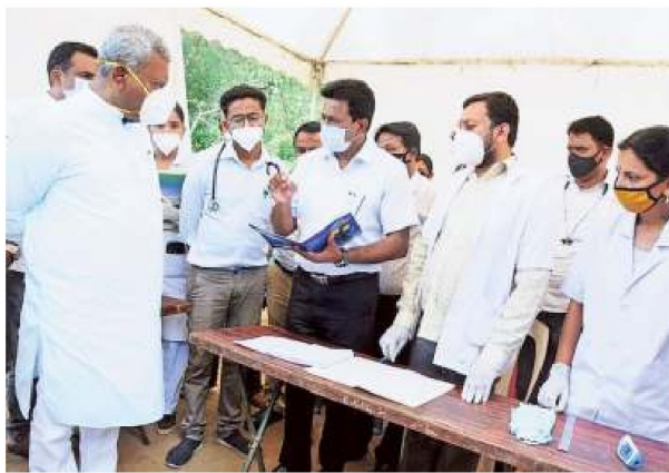
A file photo of S.T. Somashekar, who is in charge of Mysuru, speaking to health workers in the district; and (right) Deputy Chief Minister Govind Karjol, who is in charge of Kalaburagi and Bagalkot districts, holding a virtual meeting with district officials.

KARNATAKA BUREAU BENGALURU Nearly a week after the BJP government came under intense criticism from the Opposition over district in-charge Ministers not doing enough in their districts, it seems to have been a mixed effort from the Ministers, who have been present, physically or virtually, to monitor the situation. Following the criticism from the Opposition at the all-party meeting convened by Governor Vajubhai R. Vala, the Ministers were nudged to be more proactive in their districts by Chief Minister B.S. Yediyurappa. The surge in COVID-19 cases outside Bengaluru has become a cause for concern since several districts are reporting a higher Case Fatality Rate and higher cases in proportion to their population. However, it has now emerged that most of the Ministers monitoring their own home districts in their capacity as district in-charge are working from the ground, while the others remain mostly physically absent and are monitoring remotely. No one in charge Belagavi and Chikkamagaluru districts have no district in-charge Ministers following the resignation of Ramesh Jarkiholi and C.T. Ravi. Belagavi is being monitored informally by Food and Civil Supplies Minister Umesh Katti, while officials are ma-