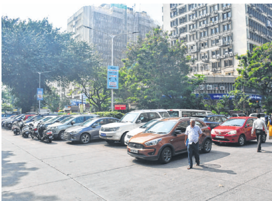
Parking contractors are said to be using more than half the road at the turning point towards NCPA from Vidhan Bhavan