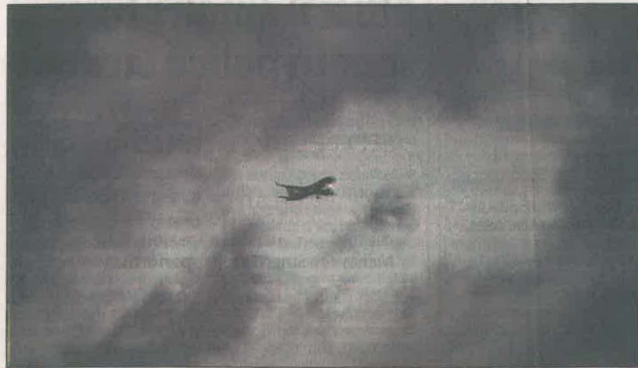
Thunder clouds gather around a flight in the morning sky at Vadodara, Friday.