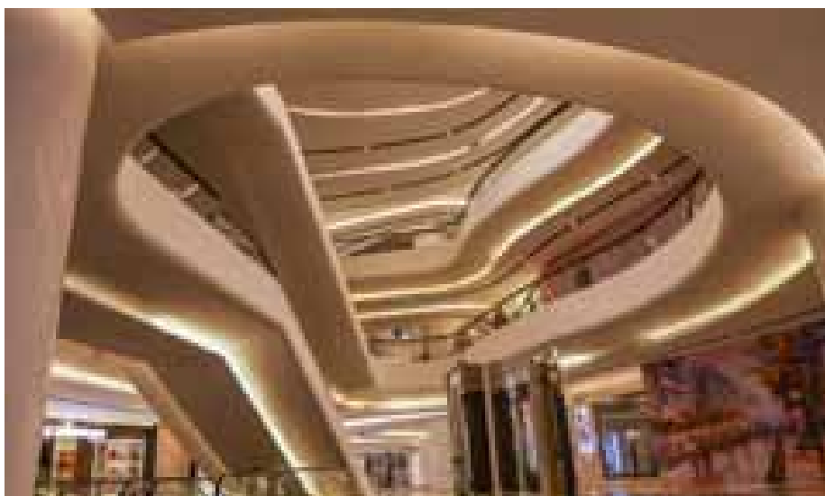
Palladium Mall Interior (Actual Image)

Palladium houses international Brands like H&M, Canali, Hugo Boss, Coach, Michael Kors, Paul & Shark and Starbucks. The Mall generated retail consumption of INR 105 Crores in FY 2018-19.