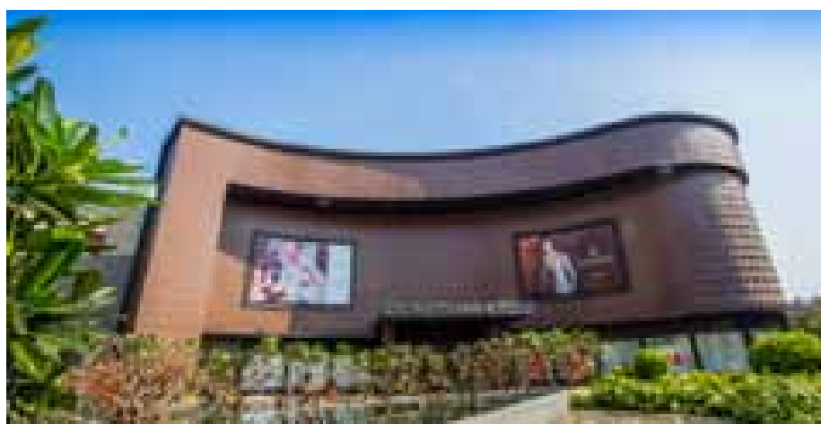
Palladium Mall Exterior (Actual Image)