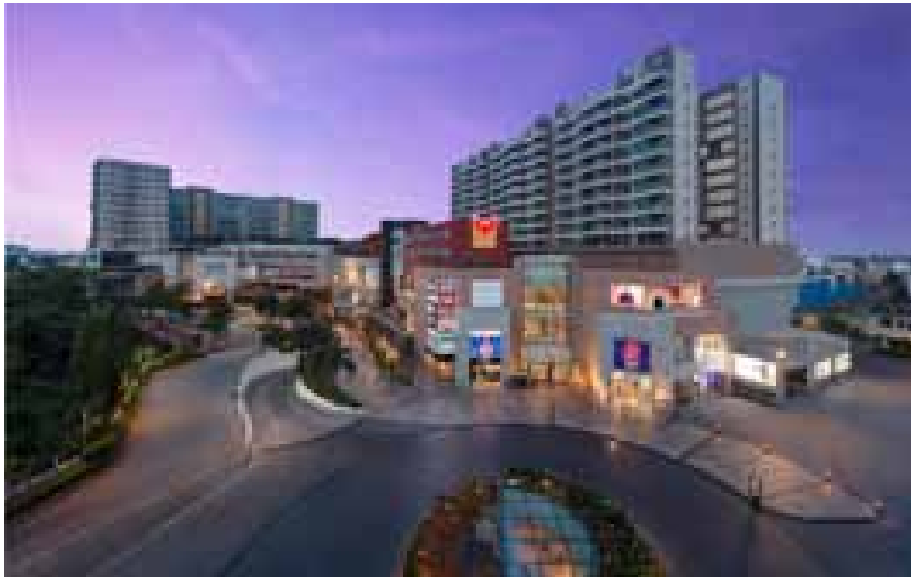
Phoenix MarketCity (Actual Image)