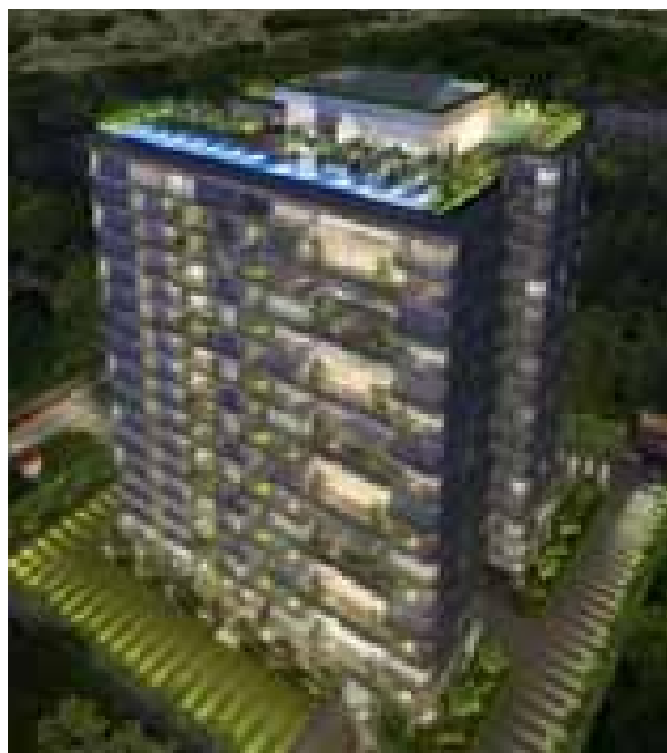
“One Crest” (Rendered Image)