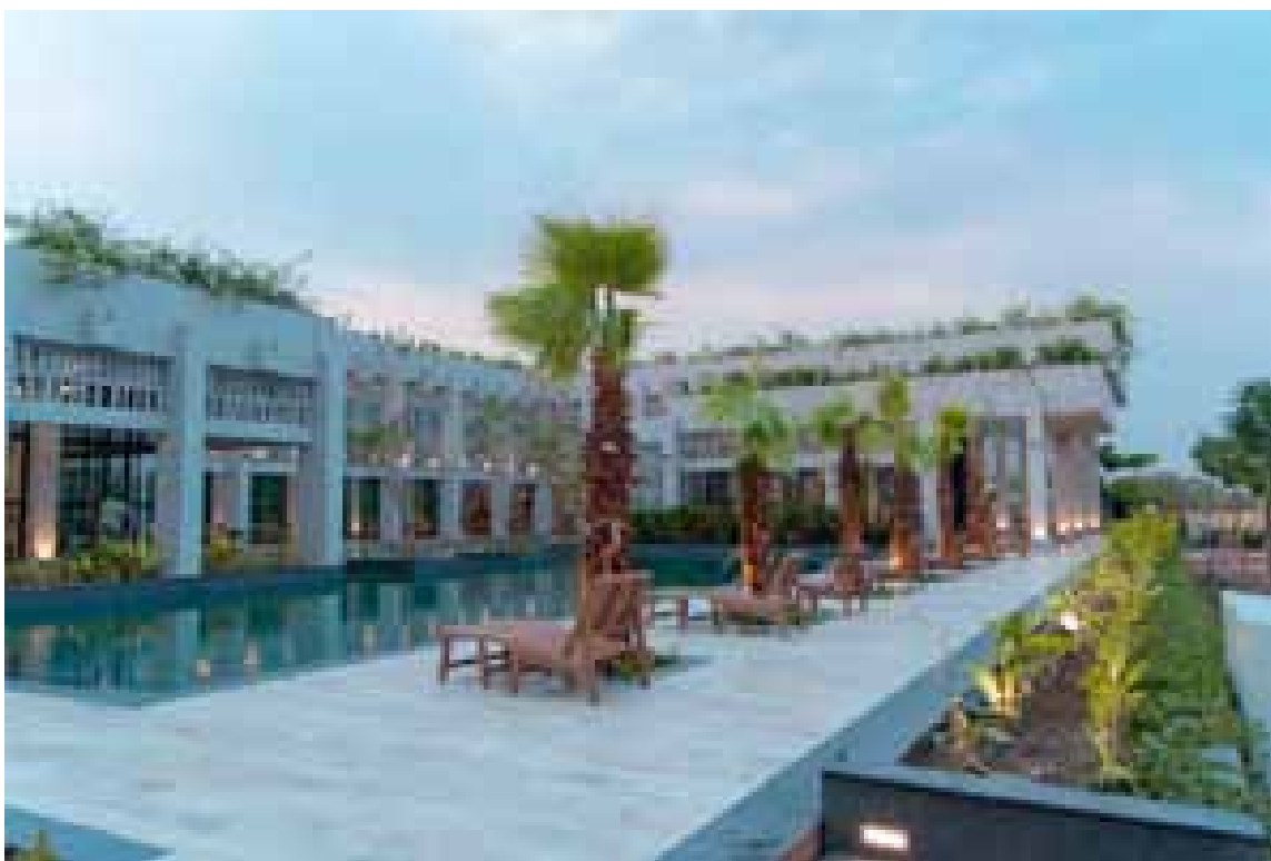
“Club Crest” in Crest Greens, Raipur (Actual Image)

The Phase I of the Project has been very well received and in spite of the sluggish market conditions we have already sold 4.34 lakh sq. ft out of 7.9 lakh sq. ft constructed. Your Company is also currently evaluating the best possible options for future development and once finalised we plan to start the Phase II on the remaining 12 acres accordingly.