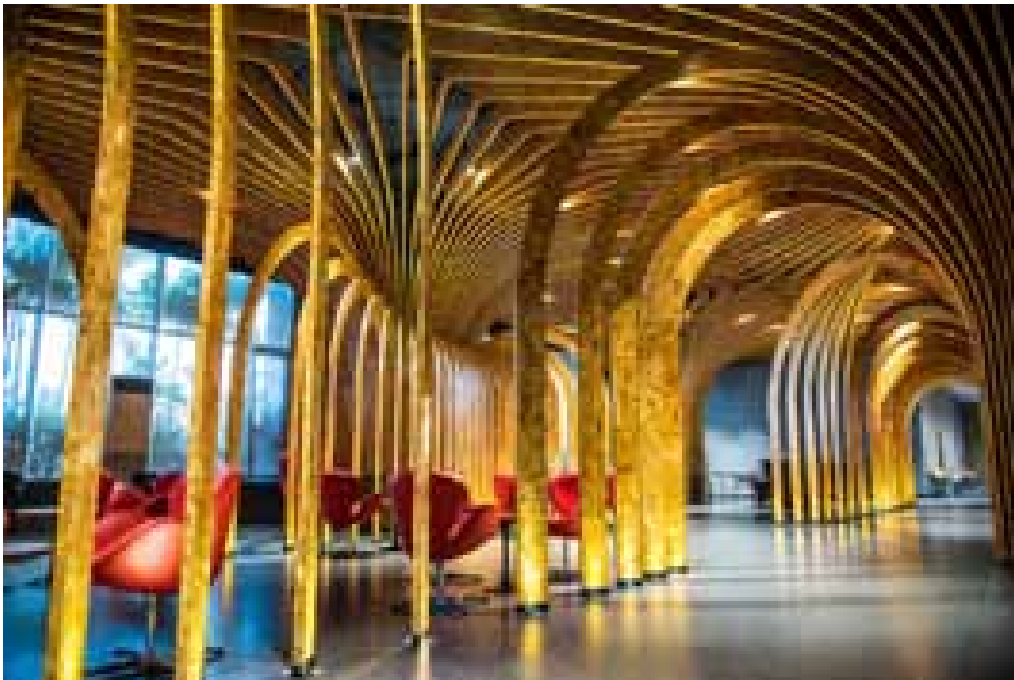
“Club Crest” at Phoenix MarketCity (Actual Image)