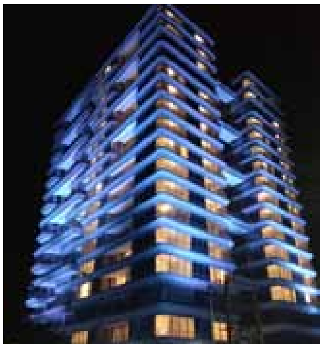
“One Crest” (Actual Image)

Despite the comparatively depressed real estate scenario in this southern state, we have seen a positive reception towards this project. One Crest has received all the clearances with the handover to be completed by December 2019.