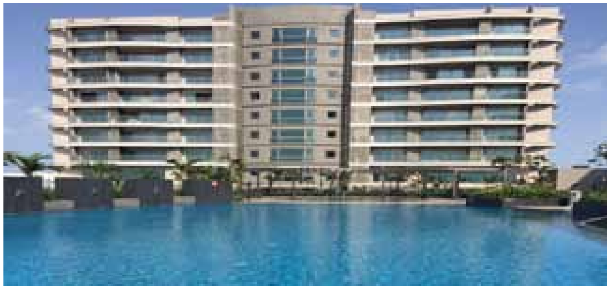
Crest Towers and The Crest (Actual Image)

Crest Towers and The Crest constitute the residential components of the Phoenix Market City Complex, Velachery. Combined the two projects offer about half a million square feet of prime residential space. Of the total 161 apartments, around 90% of the apartments have already been sold. The Company has taken a strategic decision to also lease out the balance portion of the remaining apartments.