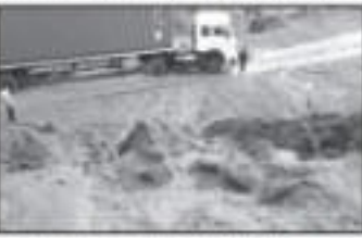
परशुराम घाट येथे पावसाने मातीचा भराव आल्याने घाट तासभर ठप्प झाला.

मुंबई, ३० - मुंबई शहरात पावसाने मातीचा भराव आल्याने परशुराम घाट तासभर ठप्प झाला. पावसाने मातीचा भराव आल्याने परशुराम घाट तासभर ठप्प झाला.