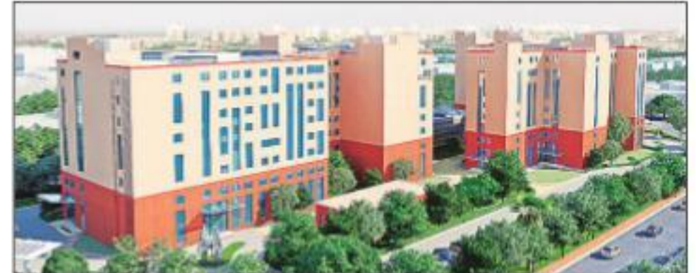
A graphic representation of the buildings.

EXPRESS NEWS SERVICE NEW DELHI, NOVEMBER 23