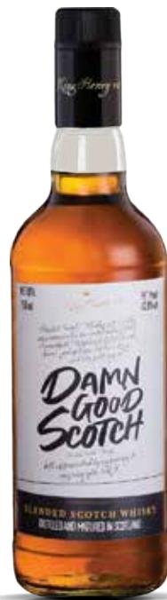
King Henry Damn Good Scotch