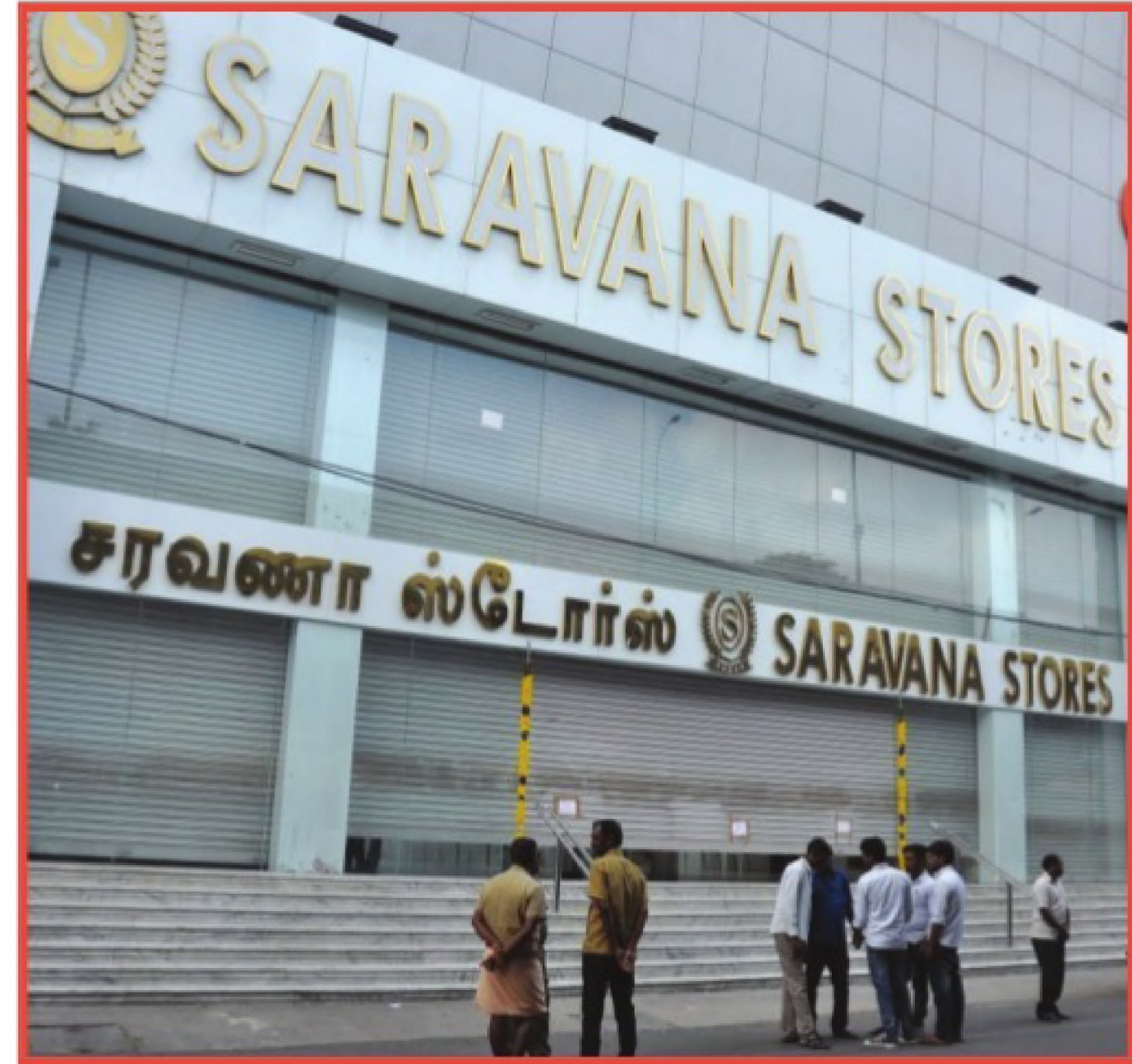
A view of Saravana store in Chennai where Income Tax (IT) officials on Tuesday searched the premises of popular retail outlets and real estate companies on the suspicion of tax evasion.