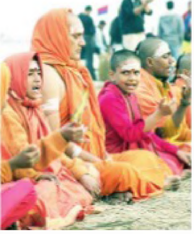
Young devotees join a sadhu for a ritual at Sangam during Kumbh Mela festival in Allahabad.

HC quashes Mizoram's long liquor ban order: The Alzawi bench of the Gauhati High Court on Tuesday quashed the order of the Mizoram government banning liquor sales from 21 December to 1 March, and instructed it to allow vendors to sell alcohol as per their license validity. PTI