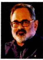
Tower Semiconductor needs to sort out the issues in the court, MoS for electronics and IT Rajeev Chandrasekhar said

It has been reported that ISMC Anand Fab had approached the government to not approve the semiconductor project application submitted by Tower Semiconductor.