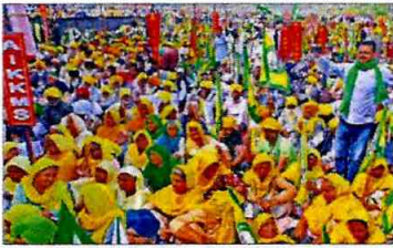
किसानों ने गांधी मंदिर परिसर में प्रदर्शन किया। किसानों ने गांधी मंदिर परिसर में प्रदर्शन किया।

दिल्ली के रामलीला मैदान में गुरुवार को किसानों ने गांधी मंदिर परिसर में प्रदर्शन किया। किसानों ने गांधी मंदिर परिसर में प्रदर्शन किया। किसानों ने गांधी मंदिर परिसर में प्रदर्शन किया। किसानों ने गांधी मंदिर परिसर में प्रदर्शन किया।