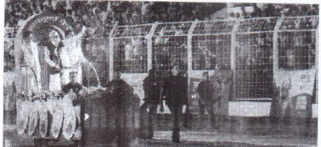
Prime Minister Narendra Modi with Goa Chief Minister Pramod Sawant during the opening ceremony of the 37th National Games at Pandit Jawahar Nehru Stadium in Goa on Thursday

PTI ■ MARGAO (GOA) Prime Minister Narendra Modi on Thursday said his government has increased its expenditure on sports by three-fold in last nine years, and reiterated that the country is prepared to host 2036 Olympics. Speaking after inaugurating the 37th National Games at Pandit Jawahar Nehru Stadium in Margao, Modi said the Games are taking place in Goa at a time when Indian sports is reaching new heights.