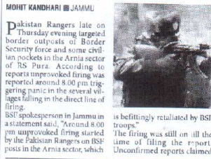
A BSF jawan received injuries during cross border firing in the Arma sector.

MOHTI KANDHARI ■ JAMMU Pakistan Rangers later on Thursday evening targeted border outposts of Border Security Force and some civilian posts in the Arma sector of RS Pura. According to reports, unprovoked firing was reported around 8:00 pm triggering panic in the several villages falling in the direct line of firing.