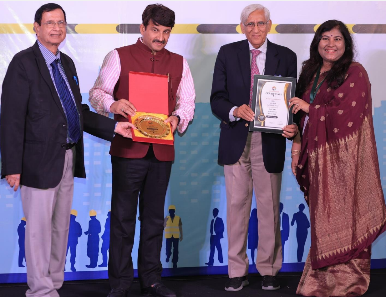
Platinum Award for HR under 'Apex India HR Excellence Awards 2023' and the Gold Award under the 'Apex India Occupational Health & Safety Award 2023'