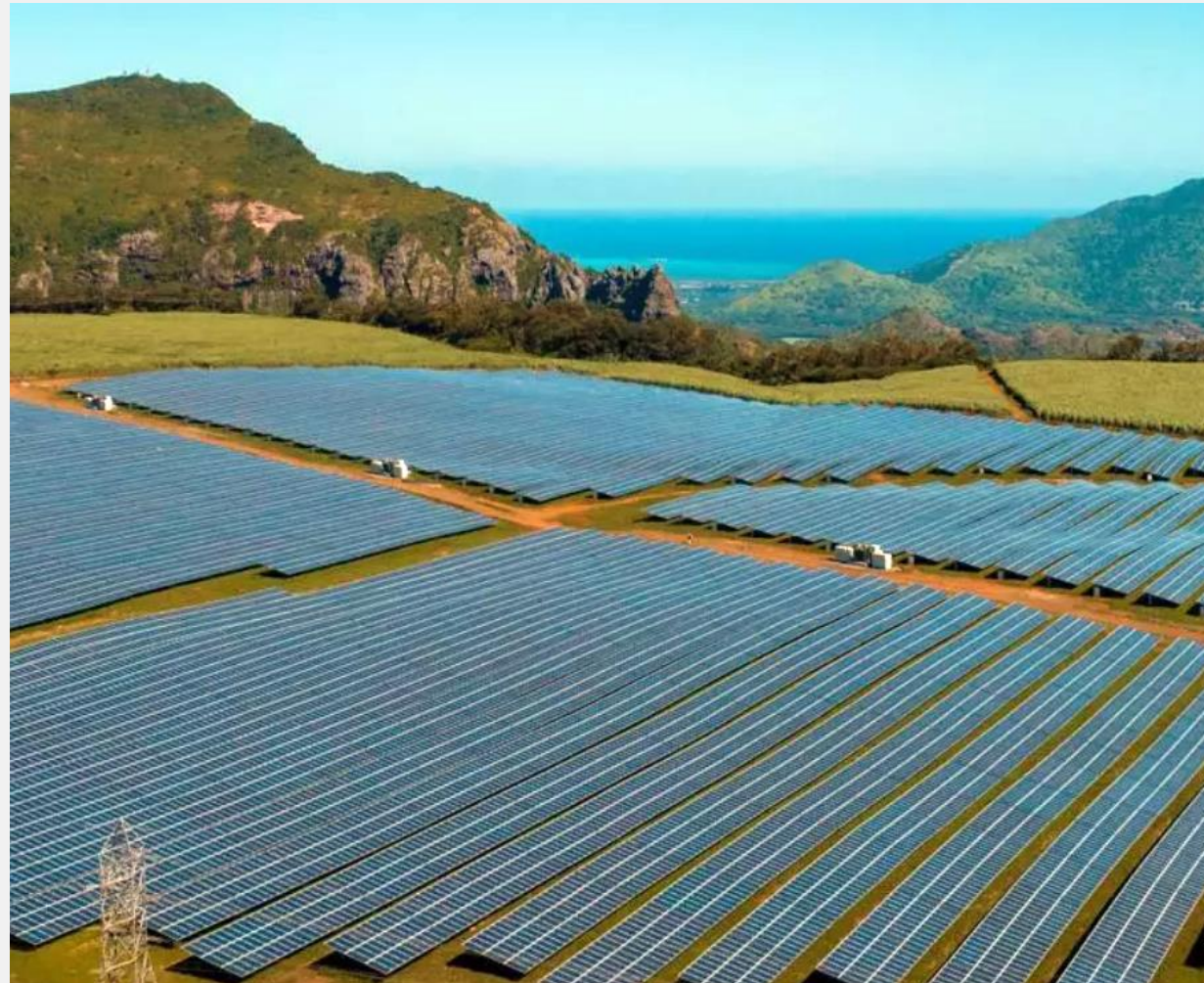
Commissioned 8 MW (AC) Tamarind Fall Solar PV Farm in Henrietta, Mauritius