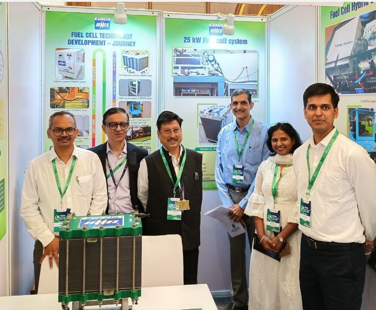
BHEL showcased its 25 kW Fuel Cell stack during 'World Hydrogen & Fuel Cell Day' event