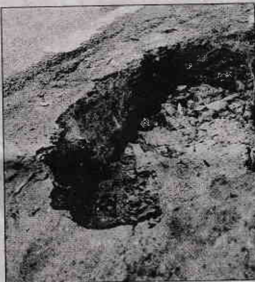
धंसी सड़क पर गहरे गड्ढे।