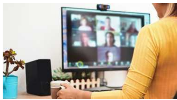
MOVING ONLINE. Many businesses will take the Webinar route for their meetings and events.