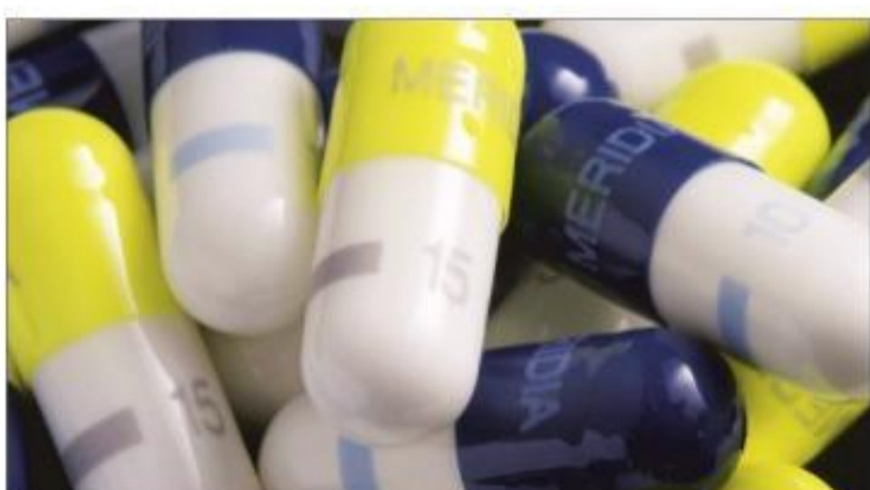
India expects to win over US companies involved in healthcare products and devices

INDIA IS SEEKING to lure US businesses, including medical devices giant Abbott Laboratories, to relocate from China as President Donald Trump's administration steps up efforts to blame Beijing for its role in the coronavirus pandemic.