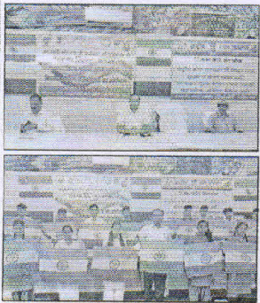
गाँवियारबाद ओपन सर्वे

तिरंगा के के प्रधानमंत्री के नेतृत्व में विकास स्तर पर 'आर्थिक' से सम्बन्धित विचार गोष्ठी एवं अंतर जाई विचार-कविता प्रतियोगिता का आयोजन किया गया