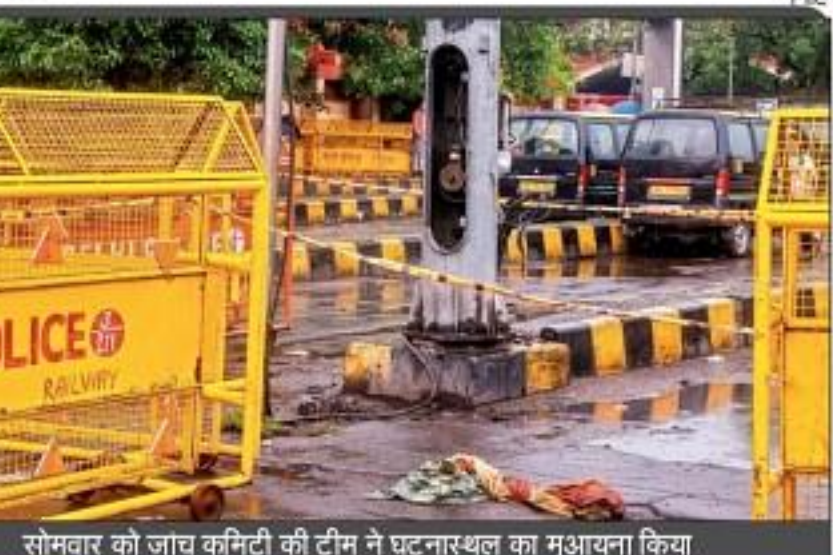
सोमवार को जांच कमिटी की टीम ने घटनास्थल का मुआयना किया

रेलवे के एक अधिकारी ने बताया कि जांच समिति में सीनियर कमश्नल मनेजर, सीनियर डिविजन सेफ्टी ऑफिसर और आरपीएफ के सीनियर डिप्टिडिविजन ऑफिसर शामिल हैं। इस जांच समिति के अलावा रेलवे पुलिस अग्नि स्तर से भी जांच कर रही है। सोमवार को रेलवे पुलिस ने स्टेशन के बाहर लगे सीबीटीवी कैमरे को भी खंगाला। सूत्रों का कहना है कि जांच समिति मुक्त महिला के परिजनों से भी मुलाकात कर उनके बयान दर्ज करेगी। सोमवार को जांच समिति ने मौक पर मुआयना किया। सूत्रों के मुताबिक, जांच जांच के दौरान जिन पहलुओं की पड़ताल करनी उसमें विजली के खंभे का मटेरियल कब हुआ, बरियर के दौरान जल निकासी की व्यवस्था क्या है, हादसे के वक्त पुलिस की मौजूदगी कैसी थी, इस खंभे की जांच व निगरानी की जिम्मेदारी किसकी है... जैसे सारे शामिल हैं।