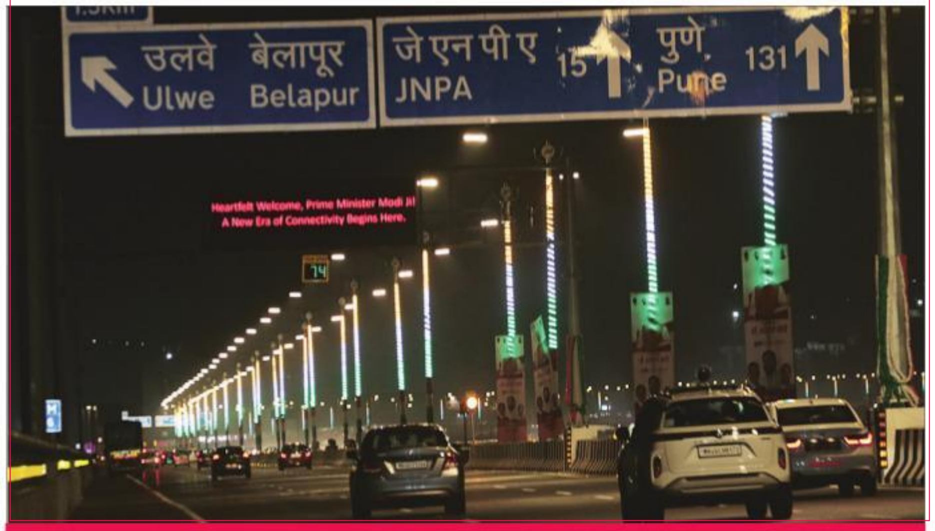
The Mumbai Trans Harbour Link, formally named Atal Bihari Vajpayee Sewari-Nhava Sheva Atal Setu, was opened to the public on Saturday. Prime Minister Narendra Modi on Friday inaugurated the 21.8-km long bridge, the longest in the country.