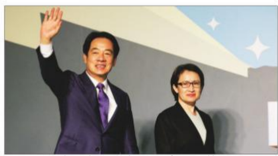
Taiwan president-elect Lai Ching-te, of DPP and his running mate Hsiao Bi-khim following the victory in the presidential elections, in Taipei on Saturday.