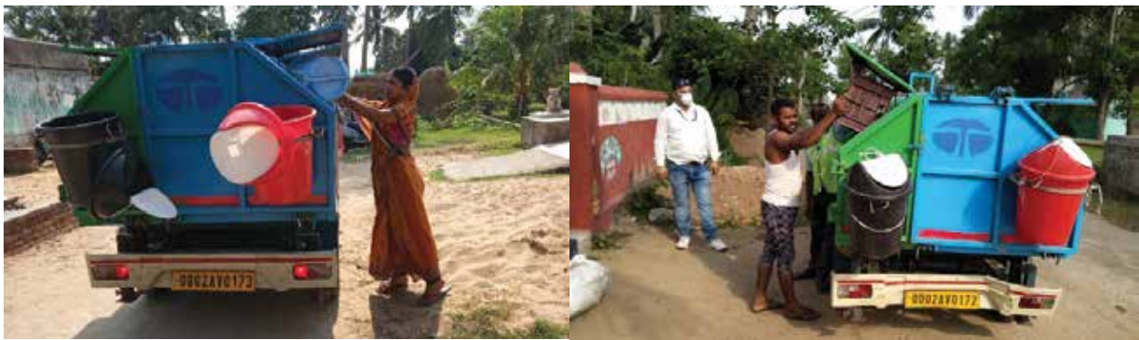
Door-to-door waste collection and public participation in segregation at source

The company has also initiated the pilot of an integrated decentralised solid waste management project in Konark, Odisha. The project follows a 'No Open Waste' or NOW approach and aims to divert approximately 95% of the collected waste from landfill or dumping sites through segregation at source and a well-established value-chain involving not only the collection staff but waste aggregators and recyclers as well. Technology will also be leveraged in this project as a digital platform is being created to help track the whole process and it will provide data ranging from level of collection & segregation to the staff attendance. Organic waste that is collected will be converted into compost.