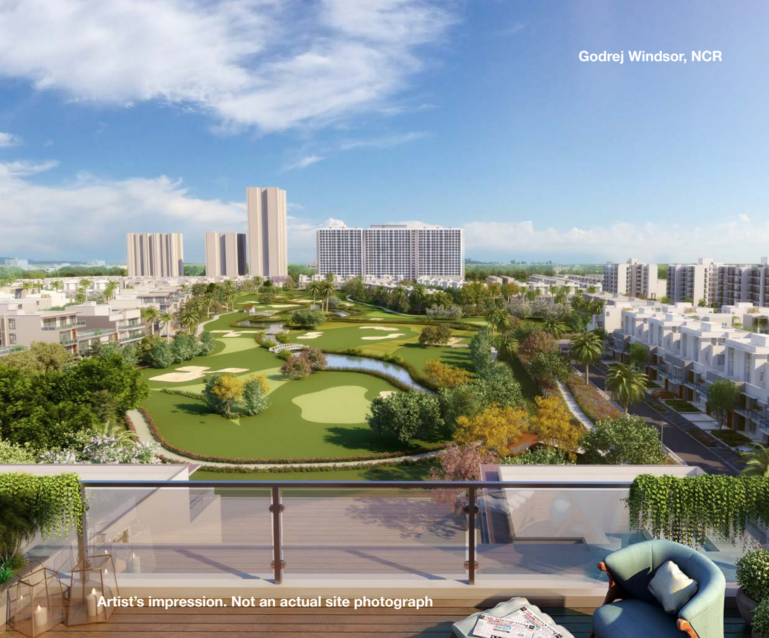
Artist's impression. Not an actual site photograph

Godrej BKC. While we have made good progress towards monetizing our commercial portfolio in BKC and Kolkata, we still have significant inventory in our Chandigarh project.