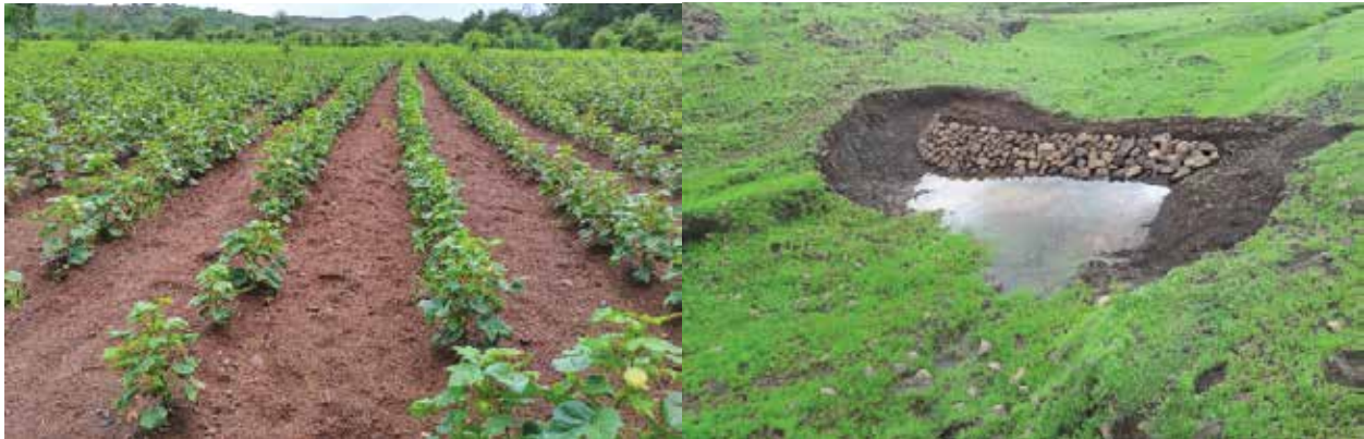
Integrated Watershed Management Programme at Beed, Maharashtra

One of our projects, the Neighbourhood Waste Management Programme, resulted in 62.8 tonnes of waste being diverted from landfill sites in FY19-20.