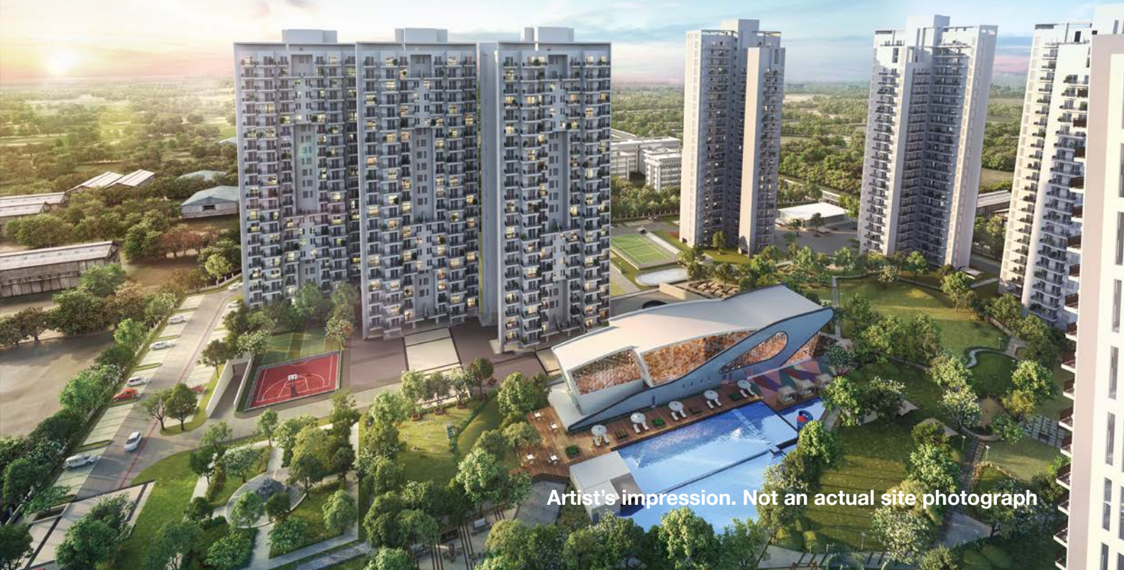
Artist's impression. Not an actual site photograph

A comprehensive HIRA master sheet comprising 101 activities have been developed to facilitate project team to formulate and develop project specific HIRA as proactive control measures in effective way.