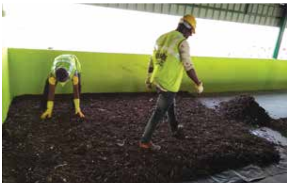
Organic waste being converted to compost at the Micro Composting Centre (MCC)

A new project for planting 15,750 saplings, using the Miyawaki method, at Kalai Village in Gujarat has also been commissioned. Around 40 native species will be used for the plantation. This project will not only lead to rejuvenation of the area but is also a means of voluntary carbon sequestration.