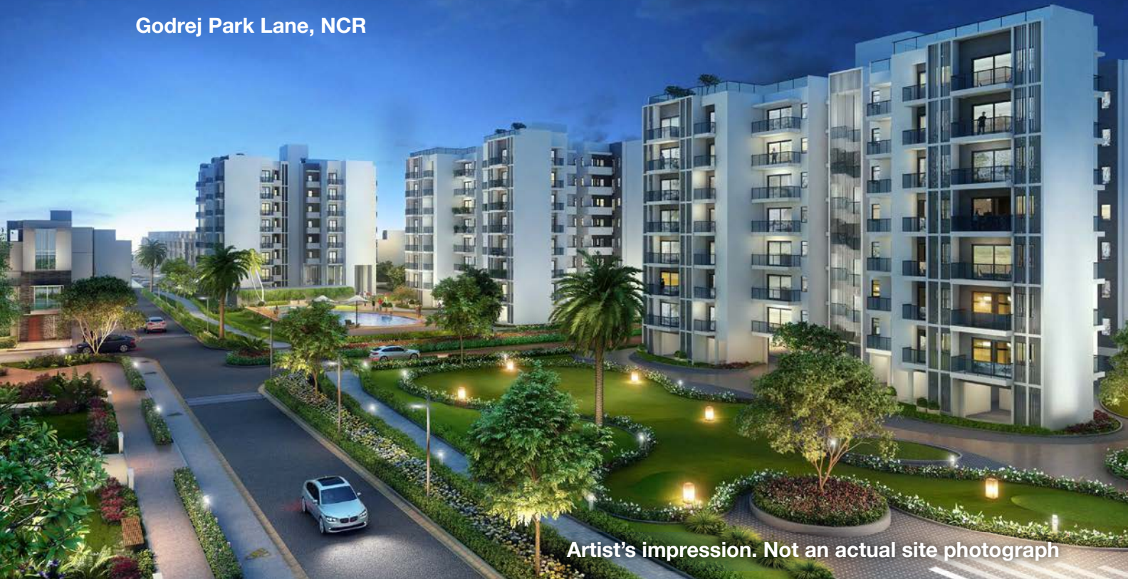
Artist's impression. Not an actual site photograph

to 4.59% of GDP, much beyond the targeted 3.8% of GDP and expected to worsen further with the dip in tax collection and revenue shortage due to the subsequent effects of lockdown on the economy. The core sector contracted by a record 38% in April as the lockdown hit all eight infrastructure sectors. According to the CSO, country's factory output growth contracted to 0.7% in FY20, as against expansion of 3.8% in FY19. Consumer durables output, an indicator of urban demand, contracted by 8.4% in FY20, compared with a growth of 5.5% in FY19.