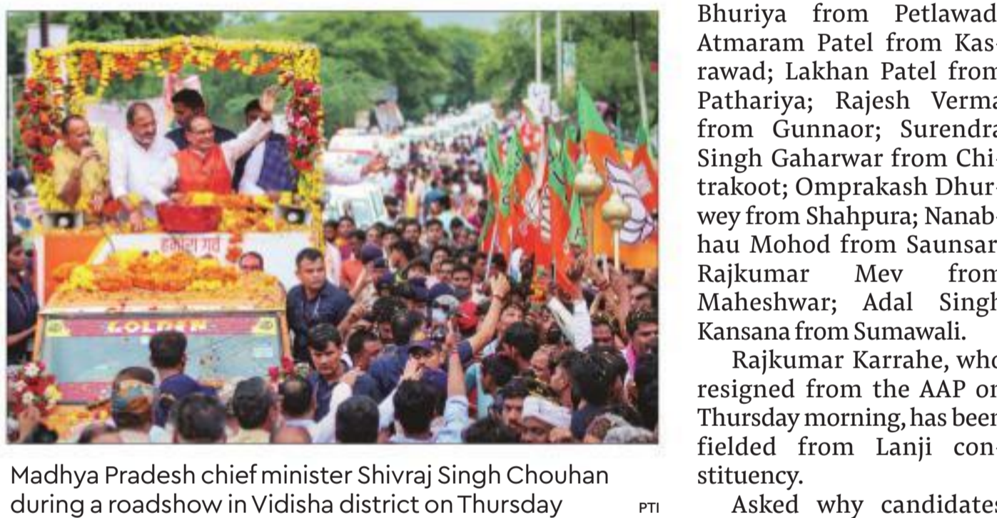
Madhya Pradesh chief minister Shivraj Singh Chouhan during a roadshow in Vidisha district on Thursday

IN A FIRST, the BJP on Thursday announced its candidates for 39 seats in Madhya Pradesh and 21 in Chhattisgarh three months before Assembly elections are due in the two states. In both states, the party has included only seats which it lost in the last elections. In Madhya Pradesh, the list includes 21 reserved constituencies - 13 Scheduled Tribe (ST) seats and eight Scheduled Caste (SC) seats. It also has five women candidates.