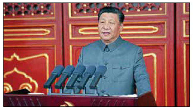
Chinese President and party leader Xi Jinping delivers a speech at a ceremony marking the centenary of the ruling Communist Party in Beijing, China, Thursday

BEIJING: Any "foreign force" trying to "bully" China will encounter a "great wall of steel" erected by over 1.4 billion Chinese people and its powerful military, President Xi Jinping warned on Thursday, as the ruling Communist Party celebrated its centenary with a massive show of strength at the historic Tiananmen Square here. In his keynote address at a highly-choreographed ceremony from the balcony of Tiananmen Gate, which also adorns a giant size photo of "Chairman" Mao Zedong, the founding father of the People's Republic of China, Xi also underlined that the "reunification" of Taiwan with the Chinese mainland is a "historic mission" and an "unshakable commitment" of the Communist Party of China (CPC). Xi, who is also the General Secretary of the CPC and Chairman of the Central Military Commission, warned that