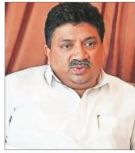
Palanivel Thiaga Rajan, Tamil Nadu minister

The IT department portfolio was previously handled by T Mano Thangaraj and he has now been assigned the milk