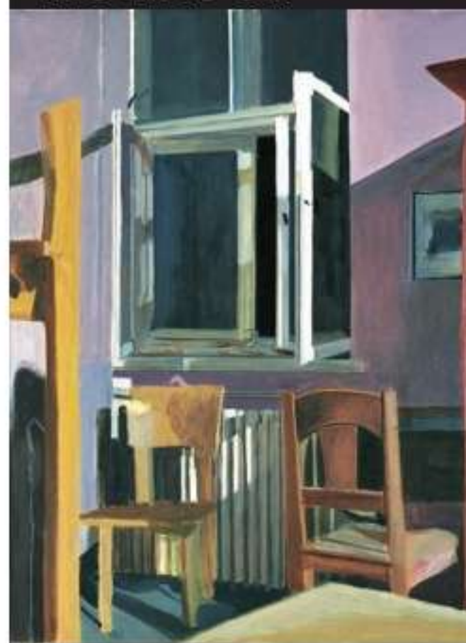
INGOLF SCHELHORN Night in front of the window

• Amazon had set up Frontizo JV with the Patni group in 2017 • Appario was scaled as a seller on the Amazon India marketplace • It emerged as one of the largest sellers dealing with categories like electronics and accessories