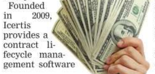
that helps businesses manage their contracts. It further helps organisations ensure visibility of these contracts, while helping them maintain compliance with local rules.

and blockchain. Icertis' latest funding round comes after it raised an undisclosed sum from German enterprise software maker SAP in exchange for a minority stake in January. Founded in 2009, Icertis provides a contract lifecycle management software