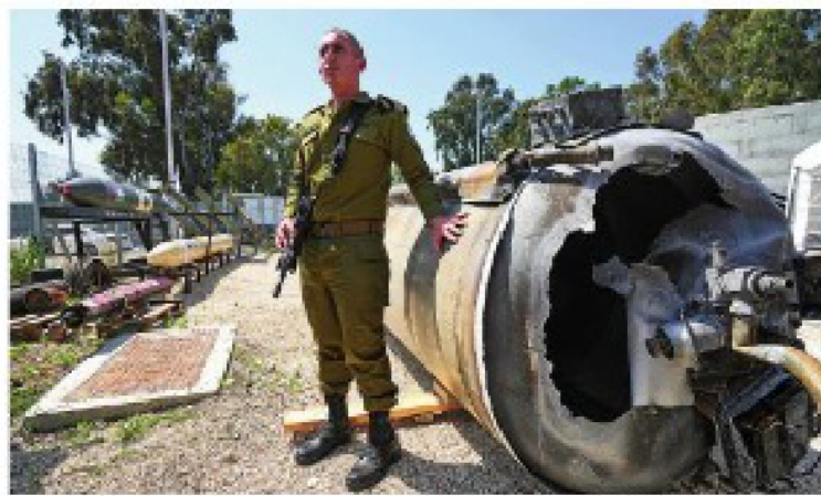
Israeli military spokesperson, Rear Admiral Daniel Hagari, displays one of the Iranian ballistic missiles that Israel intercepted.

Jerusalem: Israel's war cabinet was set to meet for the third time in three days on Tuesday, an official said, to decide on a response to Iran's first-ever direct attack, amid international pressure to avoid further escalating the conflicts in the Middle East. Military chief of staff Herzl Halevi had promised that Saturday night's launch of more than 300 missiles, cruise missiles and drones from Iran into Israeli territory "will be met with response", but gave no details.