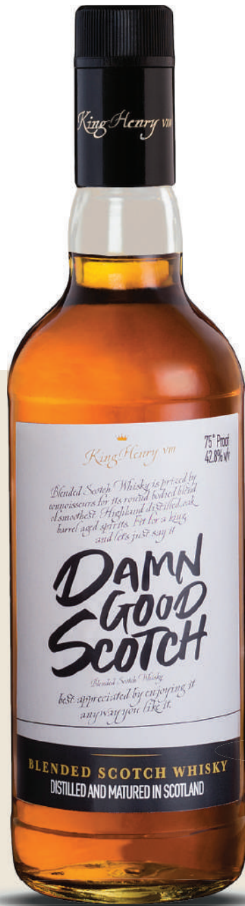
King Henry Damn Good Scotch