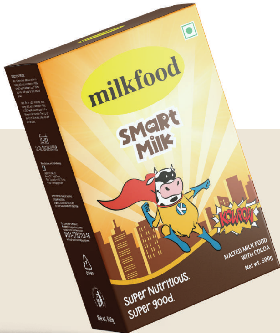
MALTED MILK FOOD