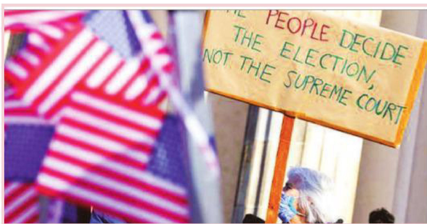
Demonstrators gather during the "Count the Votes! Rally for Fair Elections in the USA" organised by Young Democrats Abroad following the 2020 US presidential poll.

"The election could end up in #SCOTUS only if a tipping-point state is close enough that a pool of votes subject to a non-frivolous challenge (say,