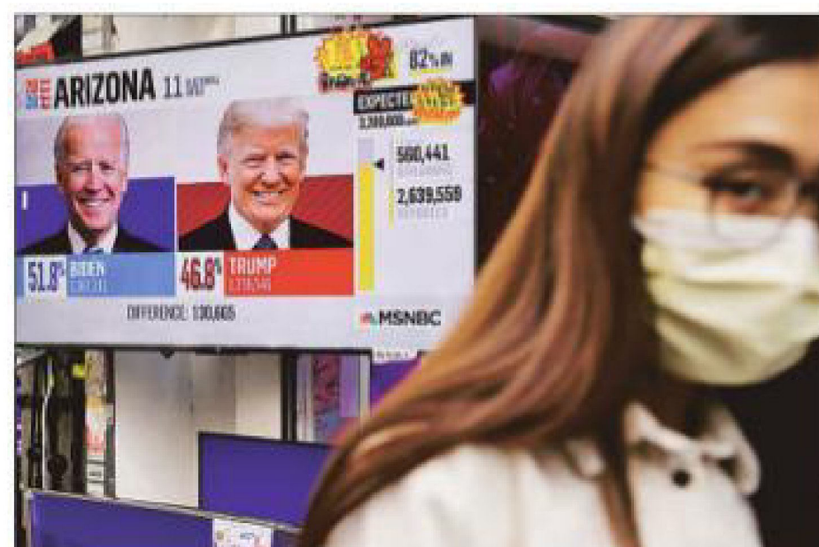
A news report of the US presidential election is seen on television screen in Hong Kong on Wednesday.

Relations between China and the United States are at their worst in decades over disputes ranging from technology and trade to Hong Kong and the coronavirus, and the Trump administration has unleashed a barrage of sanctions