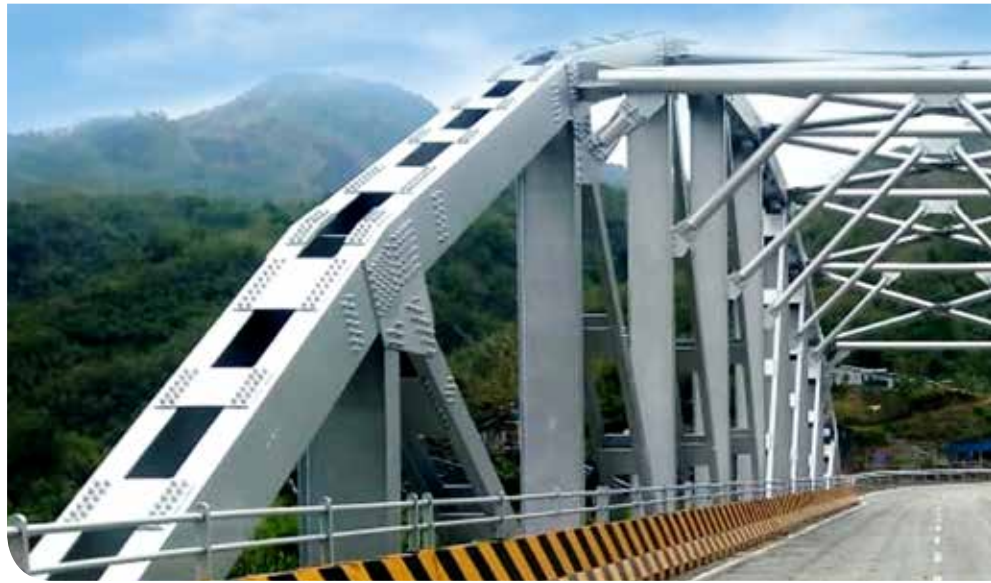
Constructed a bridge on River Tlawng in Mizoram