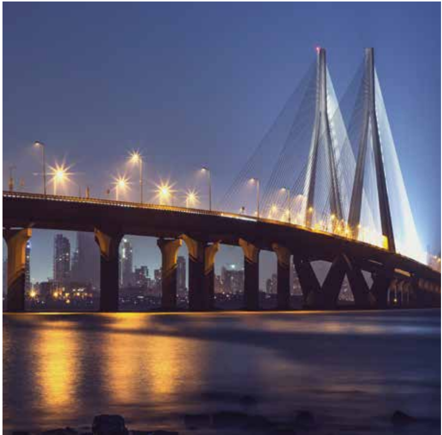
Bandra-Worli Sea Link OMT project

DURING THE YEAR UNDER REVIEW, 10,237 KILOMETRES HIGHWAYS WERE CONSTRUCTED, WHICH TRANSLATES INTO THE CONSTRUCTION OF NEARLY 28 KILOMETRES PER DAY. IN FY2019-20, NHAI ACCOMPLISHED THE HIGHEST-EVER HIGHWAY CONSTRUCTION OF 3,979 KILOMETRES SINCE ITS INCEPTION.