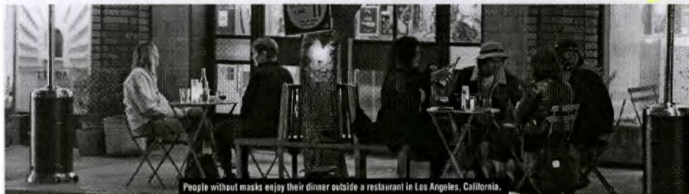
People without masks enjoy their dinner outside a restaurant in Los Angeles, California.

In a recent interview, Sharif spoke about the alleged inconveniences she had to face when she was incarcerated after being arrested in the Chaudhry Sugar Mills case last year, reported Geo News.