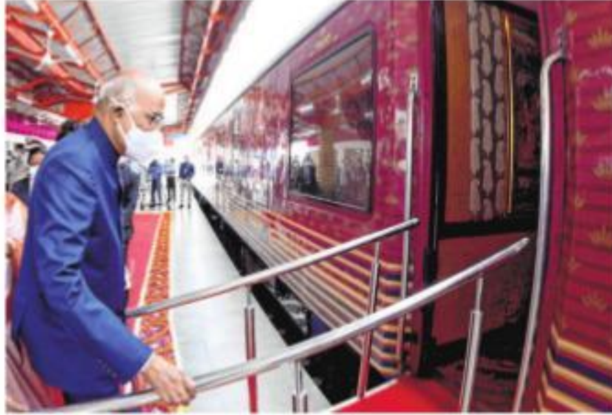
President Ram Nath Kovind boards a special train for Kanpur from Safdarjung railway station in New Delhi