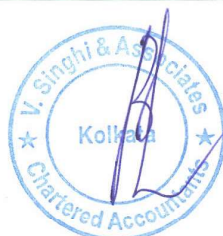
Director DIN : 01039198