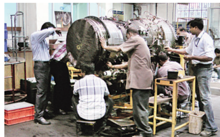
Engineers work on the Kaveri engine in Bengaluru. The DRDO has explored the possibility of using Safran's tech assistance to boost Kaveri's thrust

Safran Aircraft Engines, which will be set up on 10 acres in a Hyderabad special economic zone with an investment of €36 million, will produce parts and components