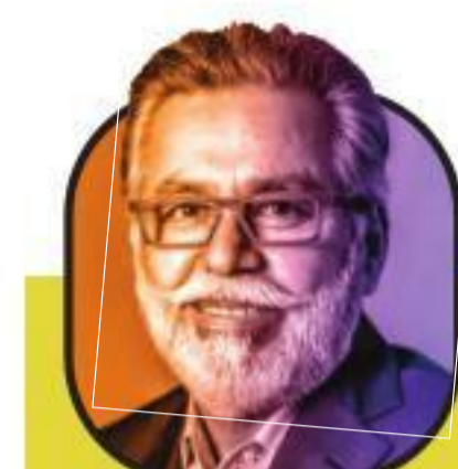
PAWAN MUNJAL CMD, HERO MOTOCORP

YOU REPRESENT THE 'Amrit generation' that will create a 'Viksit and Aatmanirbhar Bharat.' The guiding principle of inclusive and balanced development, as envisioned by Prime Minister Narendra Modi, is the cornerstone of this interim Budget. Witnessing India's growth story unfold across diverse sectors of the economy in recent years has been exhilarating. Despite concerns around the global economic slowdown, the optimism surrounding India's sustained economic growth remains unwavering.