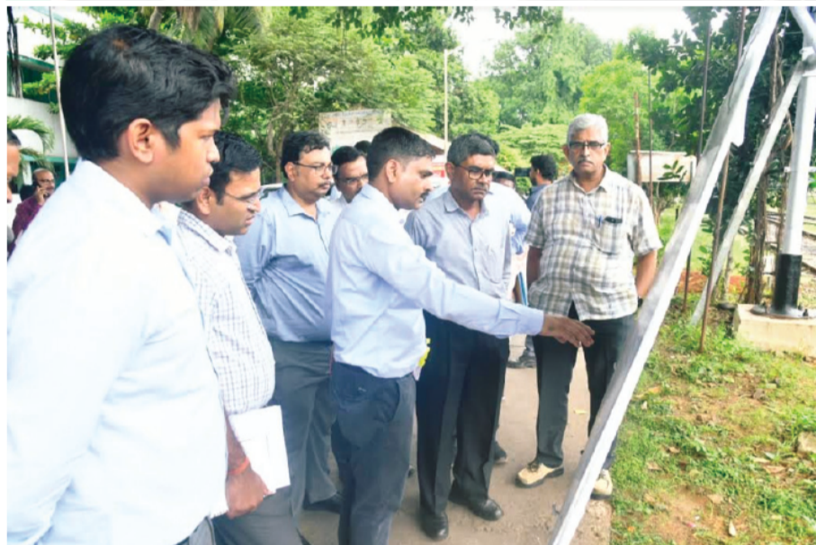
engaged in detailed discussions with officials regarding the maintenance

schedules. He emphasized adherence to scheduled maintenance activities.