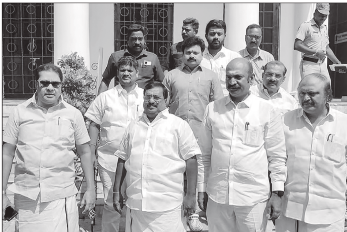
INDIA alliance members walkout of the Puducherry Legislative Assembly after their demand for 50 per cent reservation in private medical colleges for Puducherry students were not met, in Pondicherry on Thursday.

Its legacy continues to be celebrated with enthusiasm by Railway officials, rail fans and passengers, the release said.