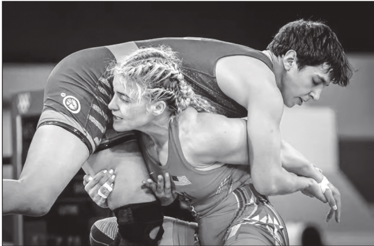
India's Anshu competes with USA's Helen Maroulis during women's freestyle 57kg wrestling pre-quarterfinal match at the 2024 Summer Olympics, in Paris, France.

Aam Aadmi Party (AAP) and Sukhbir Singh Badal of Shiromani Akali Dal (SAD) also took to social media to congratulate team India's feat.