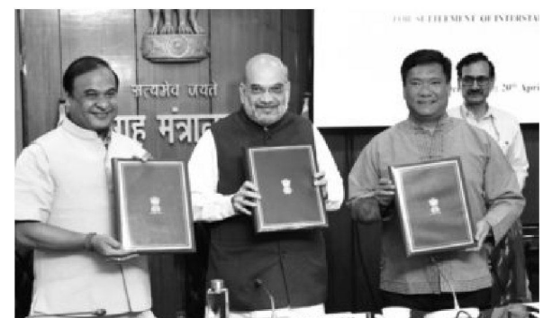
(From left) Assam Chief Minister Himanta Biswa Sarma, Union Home Minister Amit Shah, and Arunachal Pradesh CM Pema Khandu, in New Delhi on Thursday

Assam and Arunachal Pradesh share an 804.1-km-long border. The two states have been in discussions to resolve the border dispute with Sarma and Khandu signing the Namsai Declaration on July 15 last year wherein they had pledged to find a solution