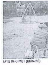
AP IN BAKHMET (UKRAINE)

Chunks of thick, twisted metal and wood splinters lie among the swings and slides in the playground outside a bombed-out school. Some streets away, a yellow bathtub dangles over the void left when part of an apartment building collapsed in a bombing.