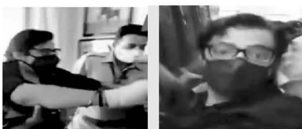
Republic TV editor-in-chief Arnab Goswami being escorted from his house by Mumbai police on Wednesday