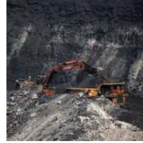
Total coal supplies hit 753.5 mt during FY24

State-run coal miner Coal India marginally fell short of its annual production target for the last fiscal as it produced 773.6 million tonnes in the last financial year against the target of 780 million tonnes.