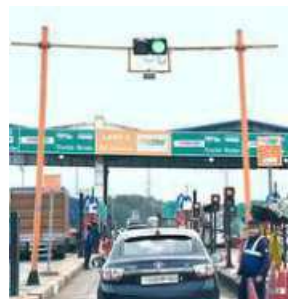
ECI has asked the NHAI to defer toll fee hike. RAJUV

The Election Commission of India (ECI) has asked state-owned NHAI to go ahead with the calculation of new user fee (toll) rates on highways, which kicks in annually from April 1 across most of tolled highway stretches in the country, but said the new rates should be applicable only after the Lok Sabha elections.