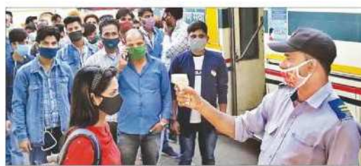
Vihar ISBT received 257 interstate buses, followed by 242 buses in Kashmere Gate and 43 buses at Sarai Kale Khan.

the terminal did not have any Covid-19 testing centre or camp for those who voluntarily wanted to get themselves checked. "I travelled all night in a bus that was full of passengers. A Covid testing centre here would not just help me, but also the city administration to identify and quarantine those who have the infection," she said. Apart from a few security guards at the entry gate, Kashmere Gate ISBT had absolutely no police officer, district official or civil defence volunteer to warn or prosecute violators of Covid-19 norms. The situation was much worse at the other two ISBTs, especially at Anand Vihar, which shares its border with Uttar Pradesh. On Tuesday, the Anand