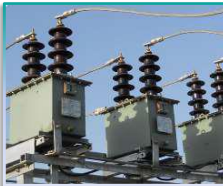
MV Current and Voltage Transformer upto 33 kV