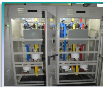
LT APFC (Automatic Power Factor Control) panels with contactor based switching