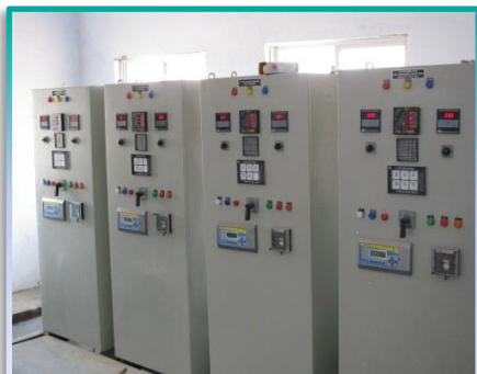
Control and Relay Panels