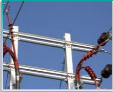
Cable termination kits, insulating sleeves, shrouds etc.