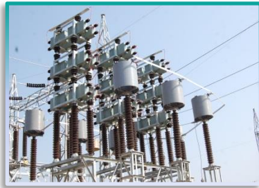
HT Capacitor banks of voltage levels from 3.3 kV to 132 kV