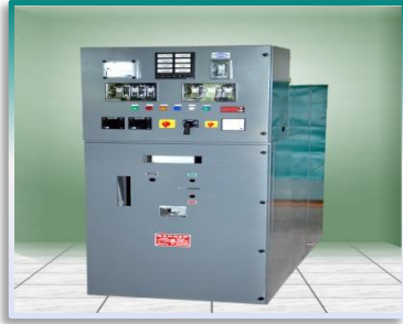
Indoor MV Switchgears up to 33 kV