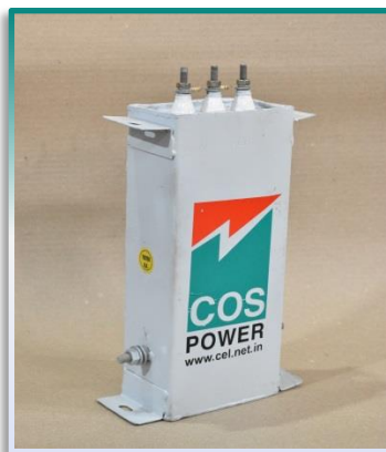
LT (APP type) capacitors for standard 415/440 V

Our Company manufactures capacitors, switchgears, harmonic filters, cable termination kits, transformers, battery and battery chargers, electrical panels etc.