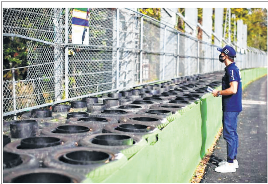
Gasly visited the crash site at Tamburello on his track walk

Gasly's is not the first Senna tribute helmet to have been seen in F1, meanwhile, with Lewis Hamilton having sported several designs paying homage to the Brazilian over the years - including most recently at the 2019 Brazilian Grand Prix - while