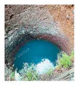
रत्नागिरी : संगमेश्वर तालुक्यात खोदण्यात आलेली विहीर.